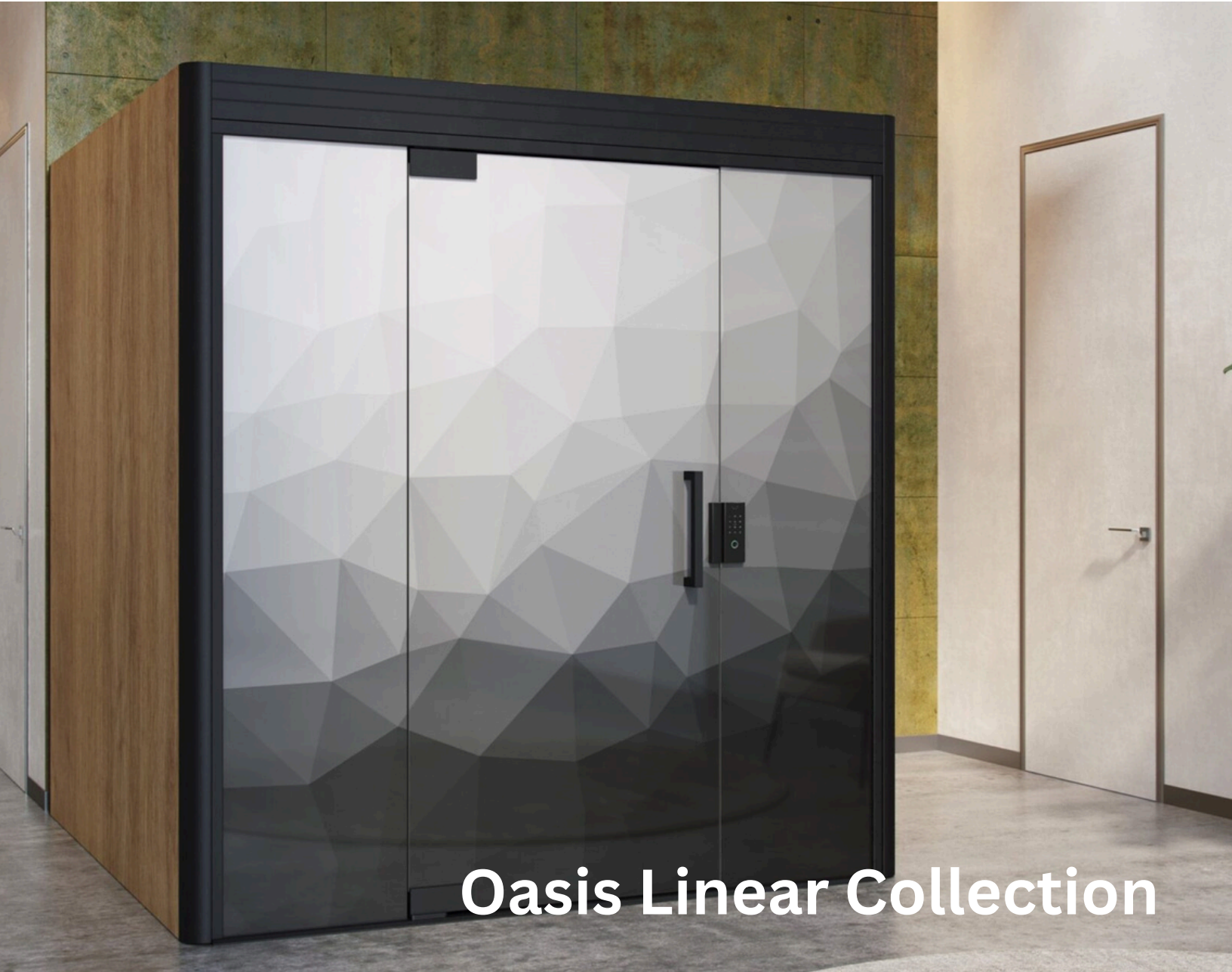
Oasis Linear Collection