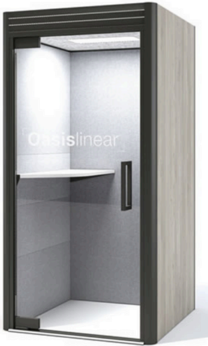
Oasis Linear Phone Booth

Create a peaceful environment for phone calls. Oasis Berco office phone booths are equipped with top-of-the-line acoustically absorbent materials, LED lighting, and an air circulation fan for maximum comfort. Plus, they offer the convenience of both sitting and standing options. Unlike other systems, Oasis Linear acoustic phone booth stands directly on your office floor, eliminating trip hazards and allowing for quick installation. ETL Listed; conforms to UL STD 962