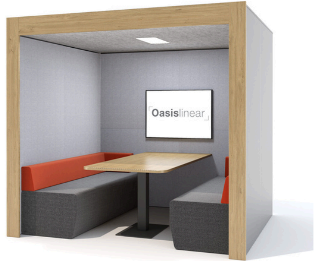
Oasis Linear Team Booth

This versatile office booth caters to all your needs, whether it's group work, presentations, video conferences, or personal activities like reflection or meditation. With ample room for three or more people, this open-front booth offers complete privacy with a full ceiling. Customize it with glass wall panels, worktops, or comfortable low back sofas to create the perfect office privacy booth for your team. Our booth is ADA compliant and ETL listed, ensuring top quality and safety.