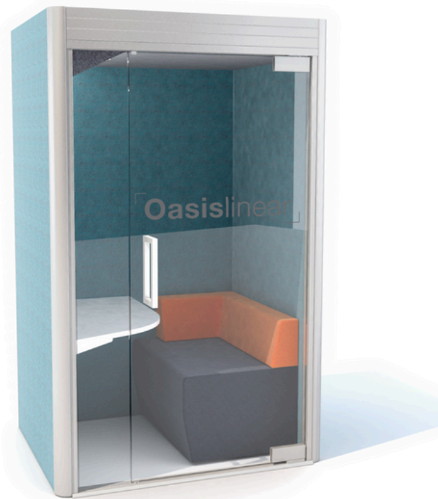
Oasis Linear Studio Pod

Oasis Linear Studio provides a serene oasis for uninterrupted work and seamless video conferences. Upgrade your work environment with our spacious Linear Studio video call booth. With 15% more square footage than our Linear Phone Booth, you'll enjoy maximum comfort and a 40% larger work surface for enhanced productivity. Whether you need a dedicated space for video conferencing, a quiet room to focus on your tasks, or a sanctuary to escape the office chaos, the Oasis Linear Studio is the ultimate office pod for you.